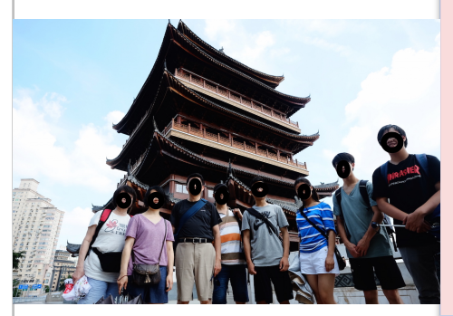
SEAC STM celebrated with fruitful results of the English Camp 愛城城南 STM 庆祝英语菅完美结束