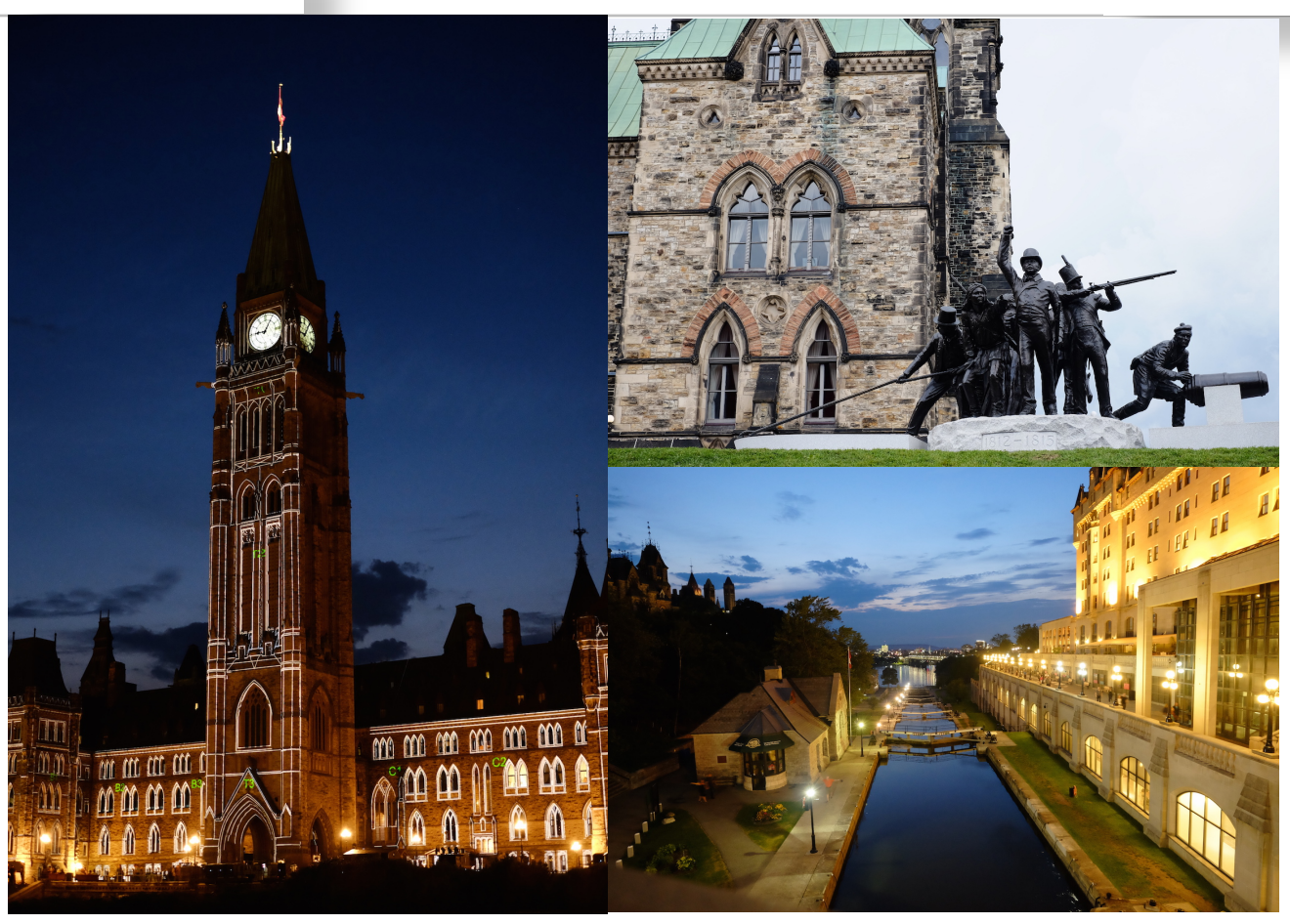
Canada celebrates 150 birthday 加拿大庆祝立国 150 周年