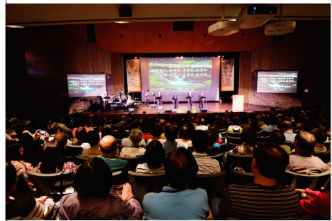
JMC in Hamilton 咸美顿市宣 X 年会

Serving with the C&MA and making disciples in the Asian Spice Region